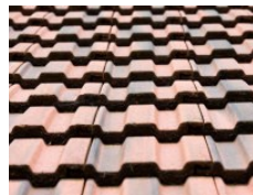
Roof Tile Association