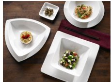
British Ceramic Gift & Tableware Manufacturers Association

We work with several subsector associations that provide specific services for their part of the industry. Members are also required to join their sectoral association (with an additional specific subscription rate).